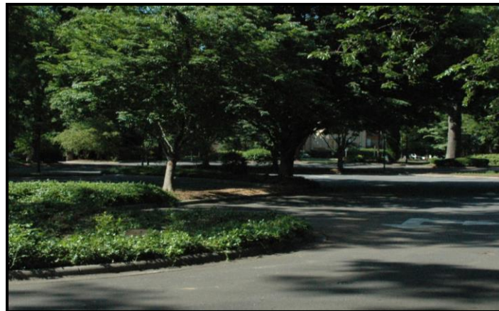
Figure 12.11-2: Example of parking lot broken up by landscaping.

12.11-2 Limitation on Uninterrupted Areas of Parking. Uninterrupted areas of parking lot shall be limited in size. Large parking lots shall be broken by buildings and/or landscape features. See Figure 12.11-2 below: